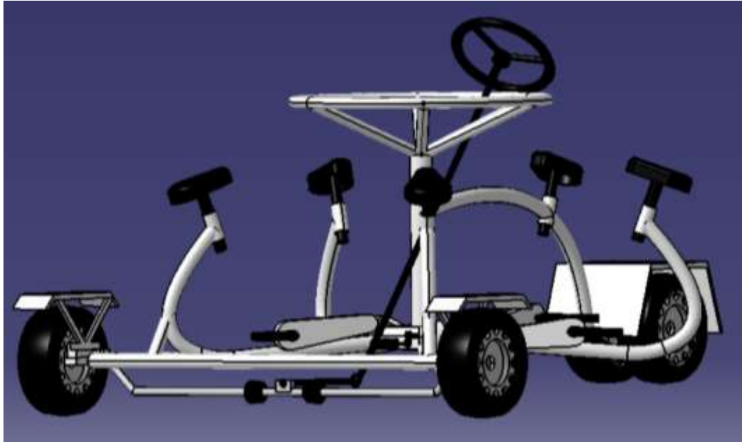
Fig1: Isometric view