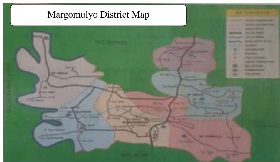
Figure 3. Margomulyo District Map

Japanese Hamlet is one of the eight hamlets included in the area of Margomulyo Village, Margomulyo District, Bojonegoro Regency, East Java Province. This Japanese hamlet is approximately four and a half (4.5) kilometers from the Margomulyo village office, approximately three and a half (3.5) kilometers from the Margomulyo sub-district office, approximately 70 kilometers from the capital city of Bojonegoro district, and approximately 250 kilometers from the capital city East Java Province. The Japanese hamlet covering an area of approximately 74.76 hectares is divided into two RTs, namely RT 1 and RT 2, RW 5. RT 1 is located at the top, and is limited by hamlet roads. While RT 2 is located at the bottom close to rain-fed river water flow (not permanent). In RT 2 the majority is inhabited by the Samin community.