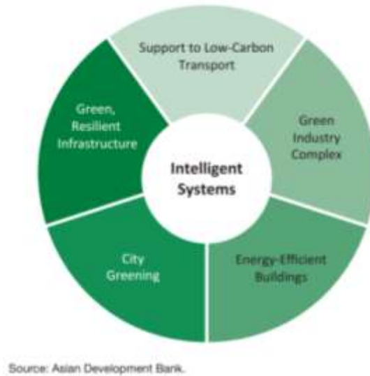
Figure 2: Investment Dimensions for Green Sustainable Urban Development