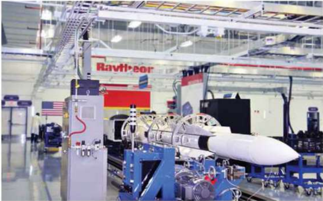
Figure 3 Big data at a missile plant [9].