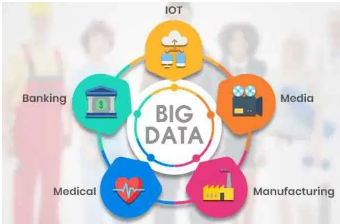
Figure 1 Real-time application of big data [2].