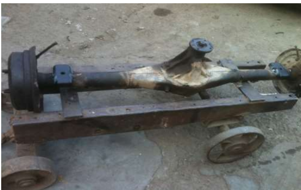
Figure 2.4.1 Rear axle with differential

The rear dead axle of was used for the transmission of power from electric motor to the wheels whereas front axle was used for the transmission of power from conventional IC engine to the wheels. On the rear side extra leaf spring was used in addition to master leaf spring to nullify the effect of weight of the electric motor and battery packs.