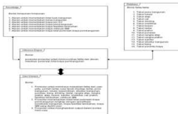
Figure 3 Architecture of System